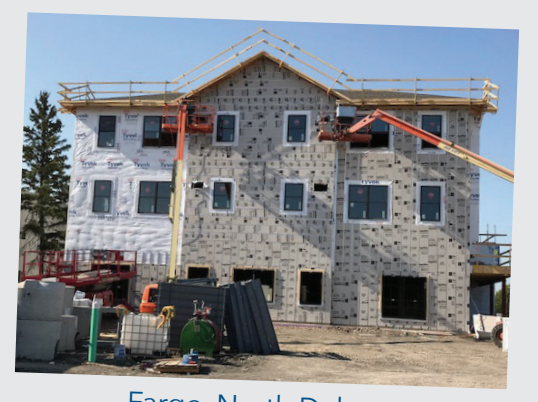
Fargo, North Dakota

It is too soon to make conclusions about the use of the HTF during its inaugural year. It is always difficult for key actors to learn about a new program and figure out how to best utilize it. The HTF presented some states and some developers with a steep learning curve because of the HTF's focus on creating apartments affordable to extremely