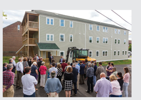
Lebanon, New Hampshire