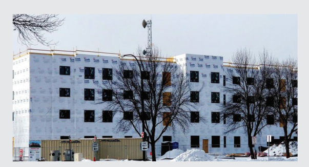
Grand Forks, North Dakota

states have awarded some 2016 HTF so far: Alabama, Montana, Nebraska, South Carolina, and Wyoming