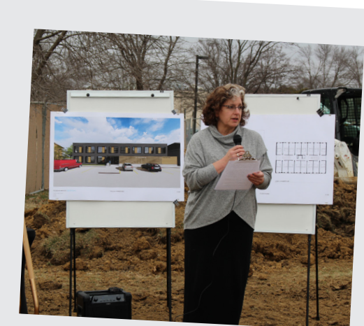
lowa City, Iowa

The sizes of projects awarded 2016 HTF money vary greatly. New Jersey, which focused on small-