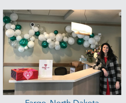
Fargo, North Dakota