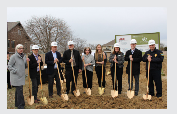
Iowa City, Iowa